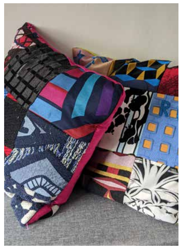
Place cushion into cover and zip up.

To give extra reinforcement, you can overlock or bind inside seams during sewing process, but this is optional.