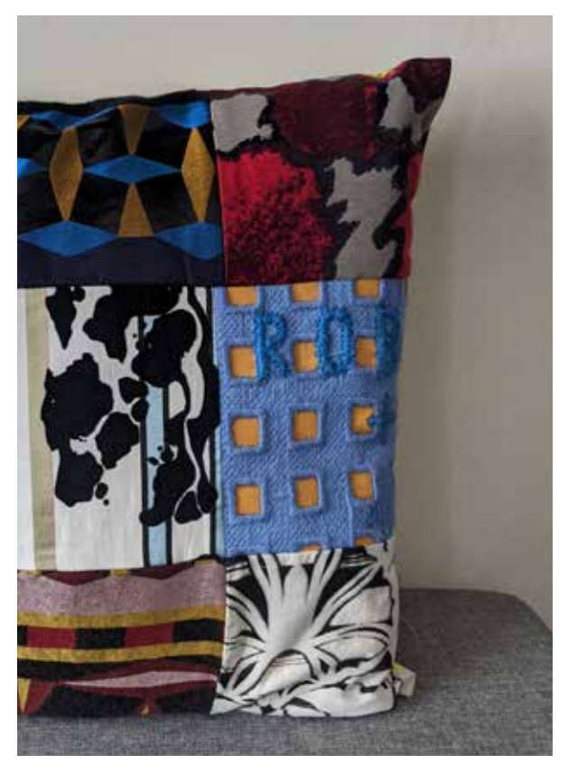
Turn your cushion cover inside out and push out all of the corners. Give the cushion cover one final press.

To give extra reinforcement, you can overlock or bind inside seams during sewing process, but this is optional.